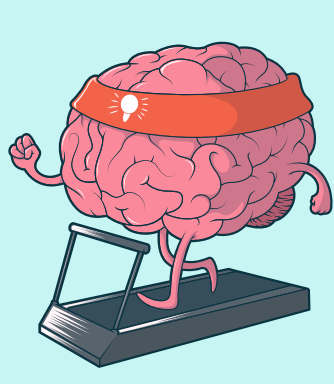
IMPROVED BRAIN FUNCTION

*Center for Disease Control & Prevention