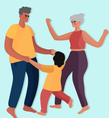
TIME SPENT WITH LOVED ONES